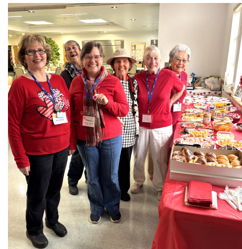
Volunteers set an inviting snack table every week, and Valentine's Day was no exception!